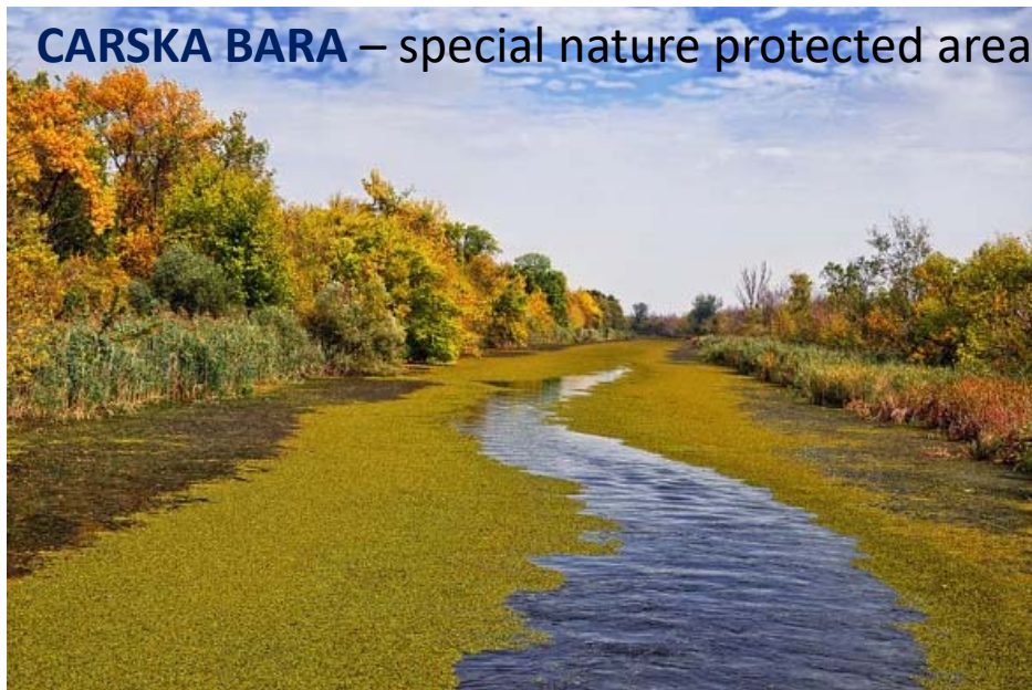
CARSKA BARA – special nature protected area